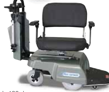
Seat swivels 180 degrees