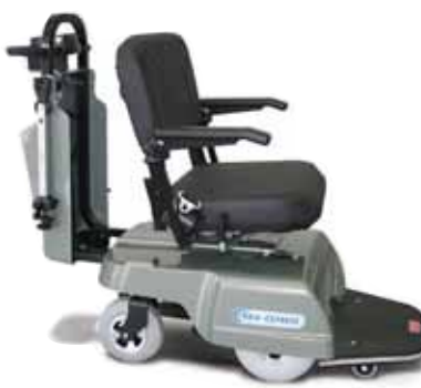
Optional IV stand holder