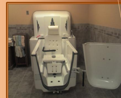
Westview Care Center Britt, IA