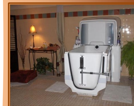
Laurels of Bon Air Richmond, VA