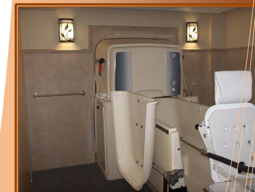
Cross Keys Village Oxford, PA