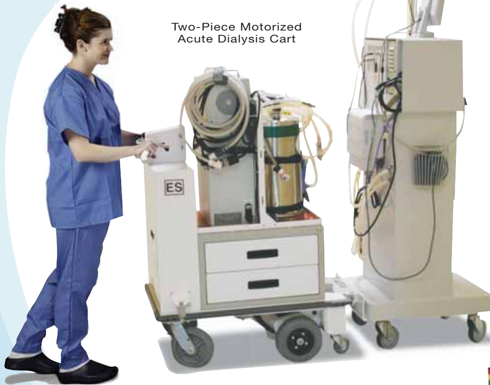
Two-Piece Motorized Acute Dialysis Cart