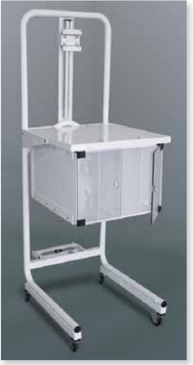
Monitor Cart With Storage Option