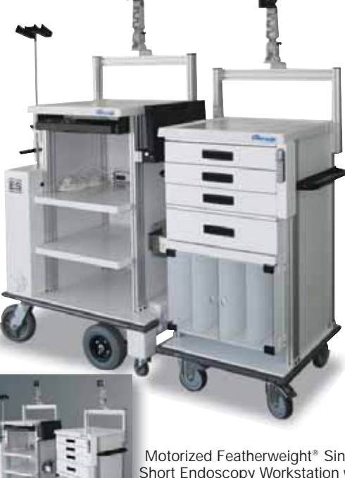
Motorized Featherweight® Single Short Endoscopy Workstation with detachable Featherweight® Single Short Supply Cart

Motorized Featherweight<sup>®</sup> Double Endoscopy Workstation with detachable Monitor Cart