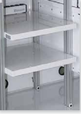
Adjustable Equipment Shelving