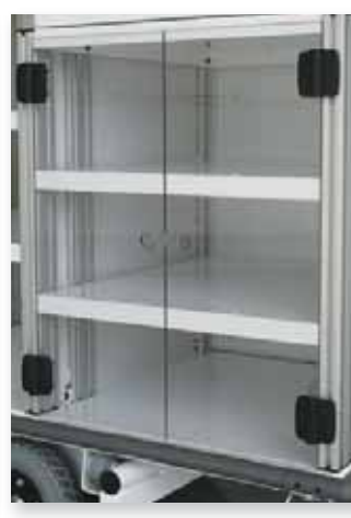
Clear Plastic Doors option