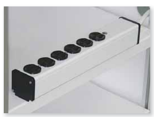
Six Outlet Medical Grade Power Strip