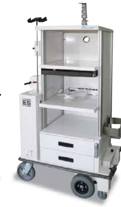
Motorized Featherweight<sup>®</sup> Single Tower Endoscopy Workstation