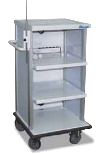
Featherweight<sup>®</sup> Single Short Endoscopy Workstation