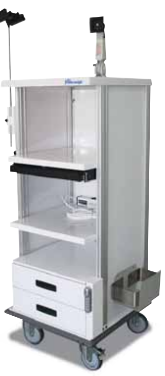
Featherweight<sup>®</sup> SingleTower Endoscopy Workstation