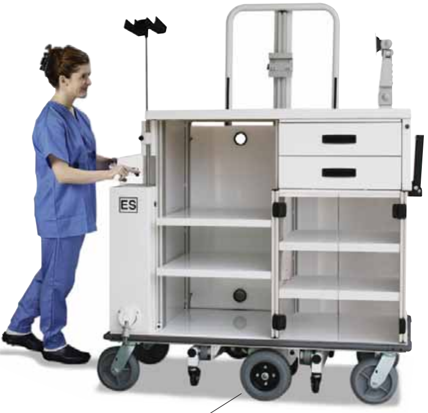
GSA Advantage!<sup>®</sup> V797P-4030b