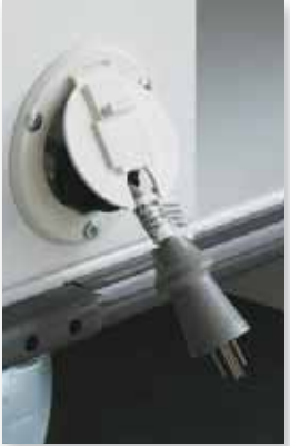
Retractable Power Cord