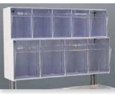
Tilt Supply Boxes