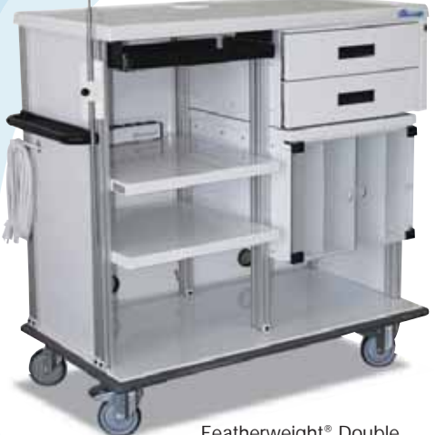
Featherweight<sup>®</sup> Double Endoscopy Workstation