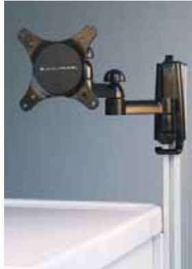
Articulating Monitor Arm